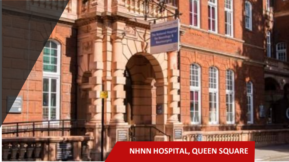
NHNN HOSPITAL, QUEEN SQUARE